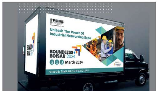
MOBILE VAN ACTIVITY